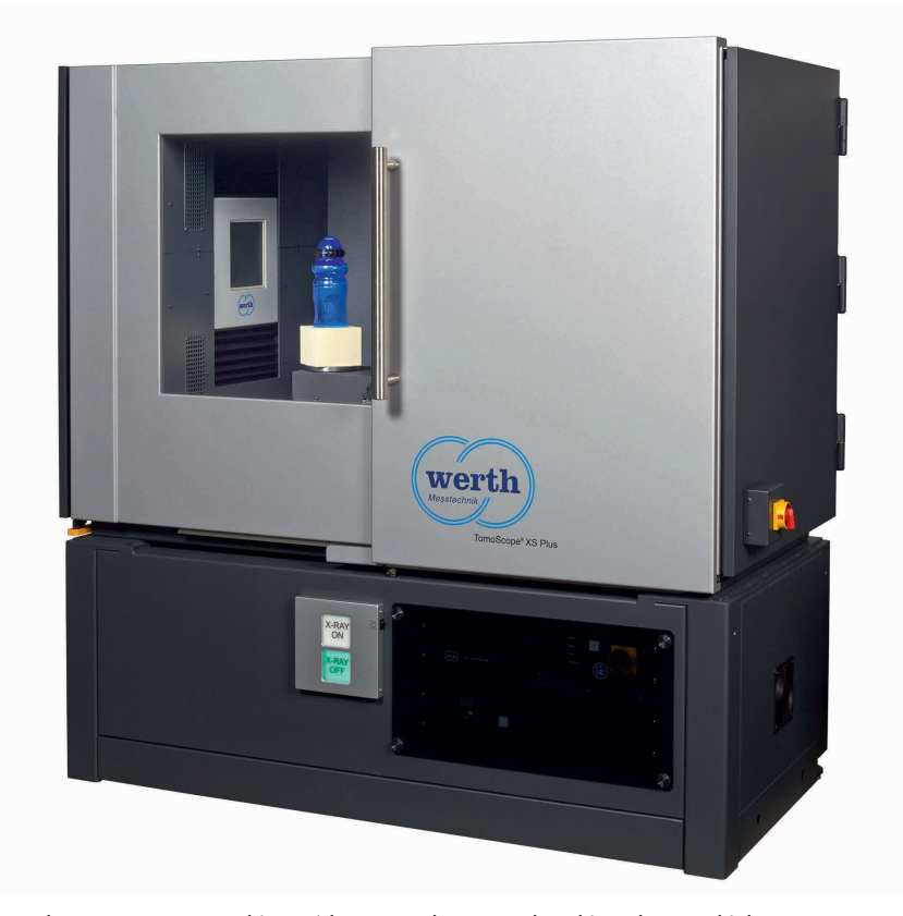
Fig. 1. Today, even compact machines with computed tomography achieve the same high accuracy as conventional coordinate measuring machines.

Today, almost all workpieces are measured with sufficient accuracy without any additional sensors. Modern transmission target tubes enable high performance with good