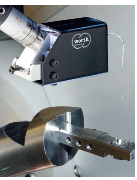
Figure 3. Gasoline fuel injector mounted on a rotary/tilt axis on the multisensor coordinate measuring machine

the capability of an optical and therefore non-contact roughness measurement in nozzle holes for manufacturing inspection at Continental.